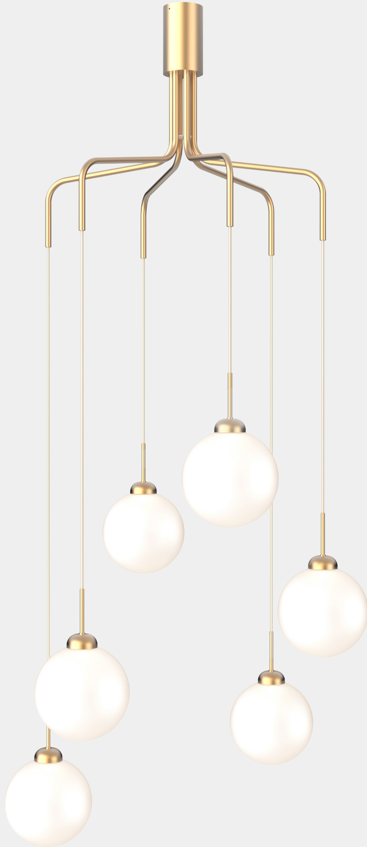
APIALES CLUSTER 6 brushed brass / opal